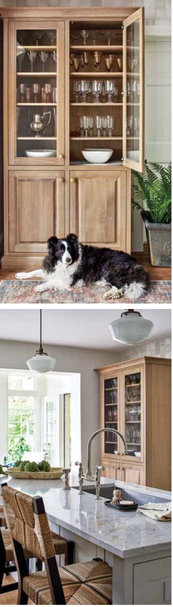
june | july 2023 27

26 cottages & bungalows | cottagesandbungalowsmag.com